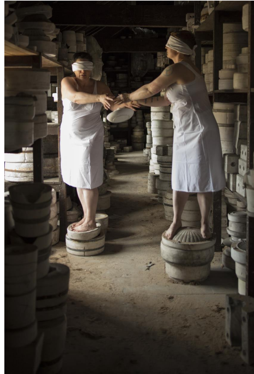
Right, from the performance First Form , Stoke on Trent September-12