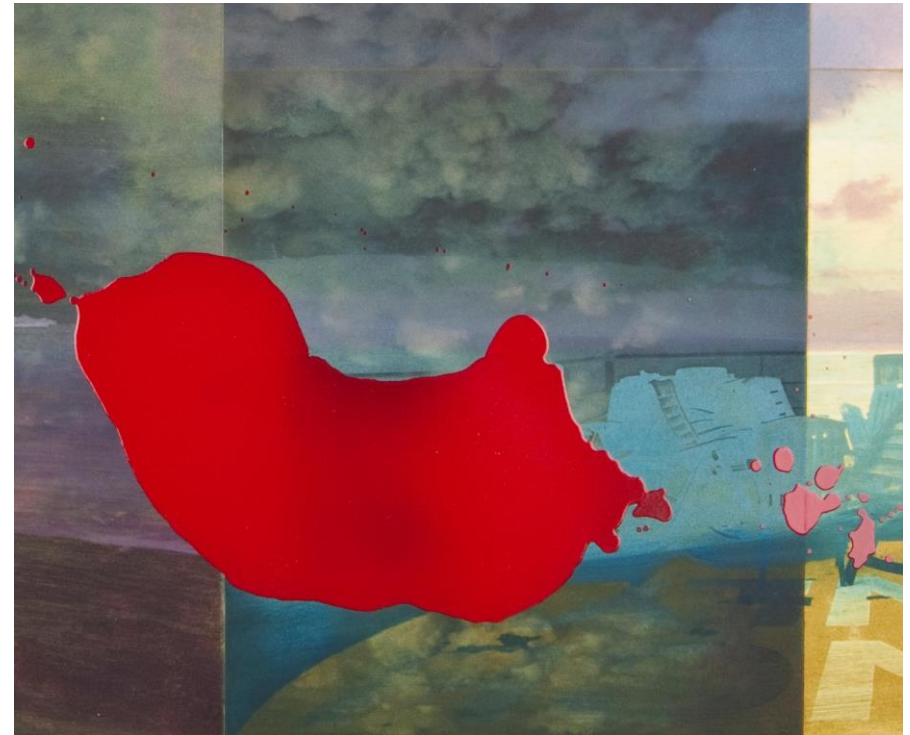
Above detail and left whole image 112x75cm From the series Horizon, mono print and lacquer on paper, Rita Marhaug 2012