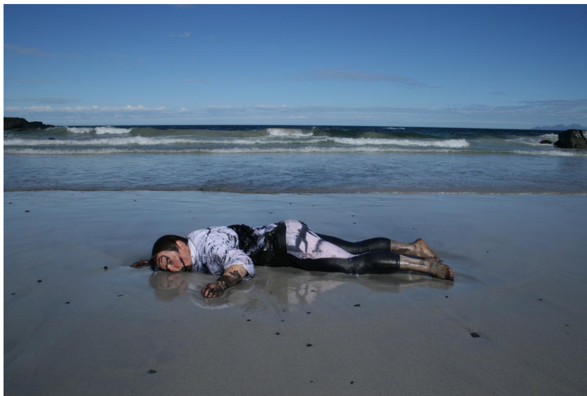
From Warszawa May, 19th, 2012 From Gimsøya, Lofoten August, 6th, 2011

In recent years, she has worked on a series of performance works under the headline Norwegian Liquid . Different colored fluids have been used to "run in and out" of her body during her shows. We will not enter details of her performances but the enclosed photos show two examples from later years.